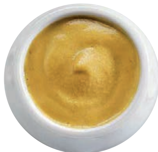
Cecile - Kent

White fish is a great source of low fat protein, which is needed for growing bodies! Adding extra vegetables like broccoli, peas, green beans (even if they are pureed) will boost vitamin C levels and provide extra fibre. Mashing carrots with a little butter increases the amount of beta carotene that is available.