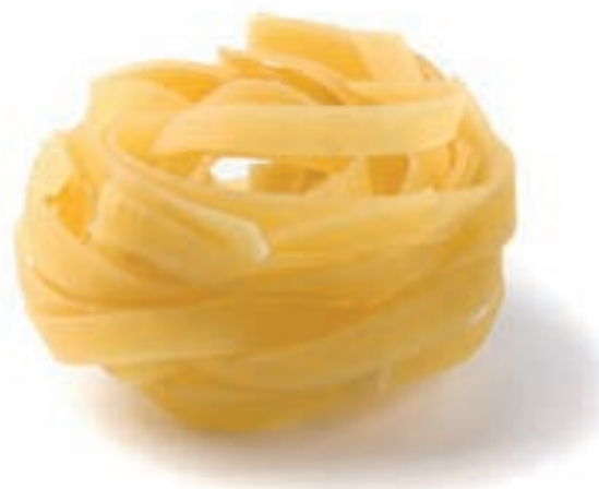
Eloise - Leeds

This dish would work well with a mix of cooked vegetables such as carrot, peppers, peas, courgette, broccoli florets (which can be pureed). Using wholemeal pasta will increase the fibre and vitamin B content.