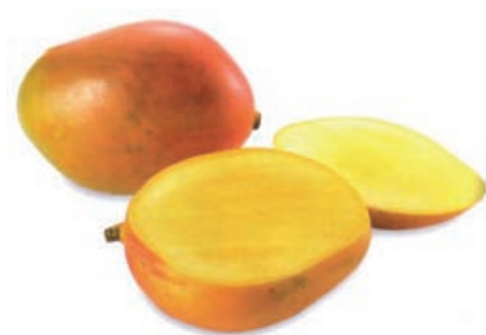
Sandra - Maple Cross

Mangoes are a great way to get lots of vitamin C into the diet. They are also rich in manganese which is needed for healthy growth, especially the joints. It is particularly helpful for "growing pains".