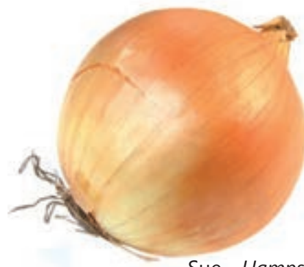
Sue - Hampshire

This is a great recipe to add extra vegetables to, increasing fibre and vitamin C content. The tomatoes in this dish provide good levels of Lycopene, a powerful antioxidant that protects against cancer and heart disease.