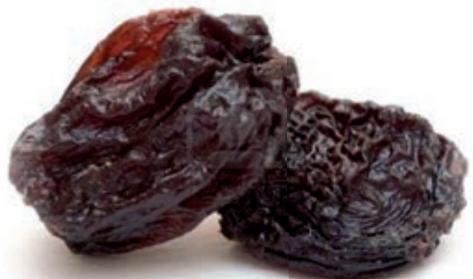
Penny - Merton Park

Porridge oats are a great way to start the day as they maintain energy levels throughout the morning. Swapping the raisins for chopped mixed nuts will give good levels of essential minerals like calcium, magnesium and zinc, which are all needed for healthy bones and teeth.