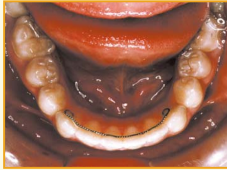
A fixed retainer

Your speech will be different. Practice speaking with the brace in place e.g. read out aloud at home on your own, and in this way your speech will return to normal within a couple of days.